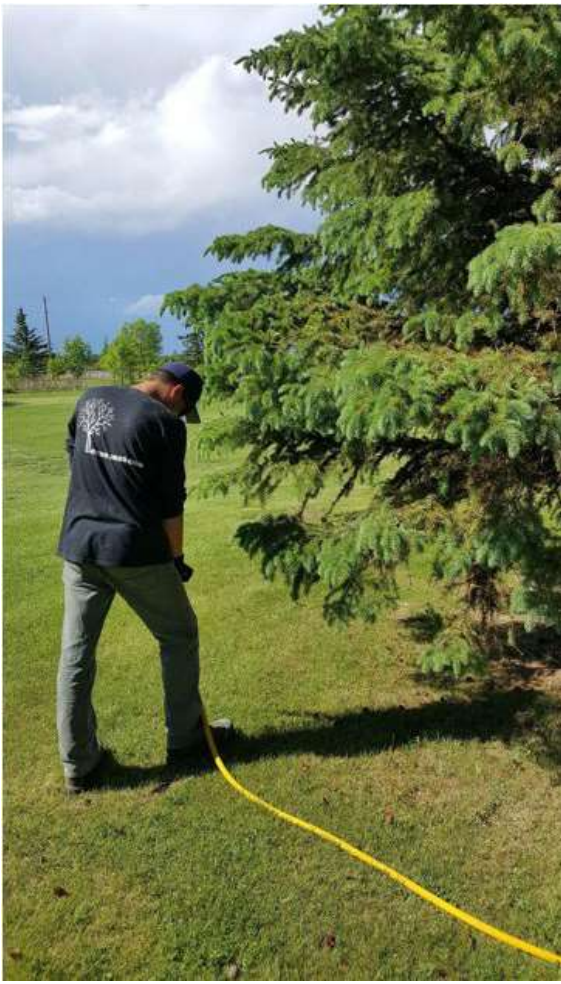
2020 Soil injected fertilizer program

Application of sub-surface tree specific fertilizer to active root zone of newly planted juvenile and high profile trees. Blends specific for new transplants and conifers to be applied accordingly. The application method is through soil injection. Pressurised fertilizer solution is distributed radially into the active root zone. The injection method helps to loosen compacted soils and improve root establishment into surrounding soils by improving soil pore space.