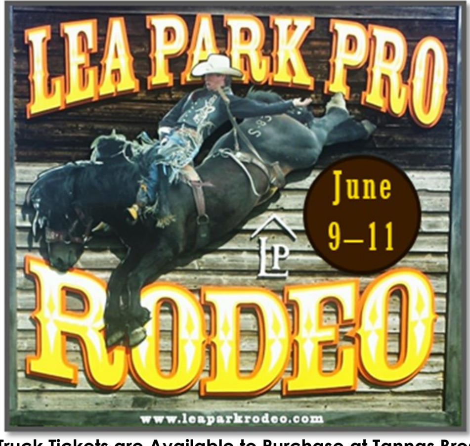
Truck Tickets are Available to Purchase at Tannas Bros Home Hardware