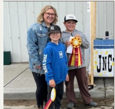
BEST TASTING LEMONADE JNC'S FRESHLY SQUEEZED