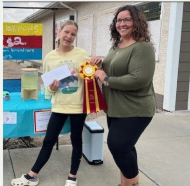
BEST LEMONADE STAND LEMONDROPS + LOLLIPOPS