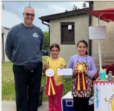
ENTREPRENEUR OF THE YEAR SWEET & SOUR SISTERS

THANK YOU TO OUR HOST BUSINESSES, TANNAS BROS. HOME HARDWARE, D&D GROCERY AND THE VAULT.